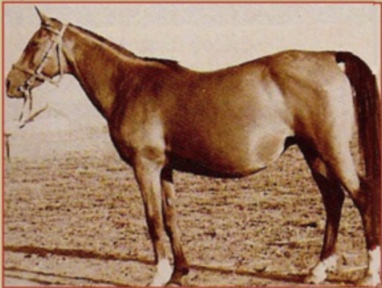
MAMMONA RUSSIAN LINES

So what is the point in listing twenty types of Arabians only to argue for racing? The racing type of Arabian is the truest type in my opinion. Raswan describes the Kuhailan, Jilfan, Abu Urkub and Muniqi as having superb racing attributes and the Kuhailan as the ultimate expression of the desert Arabian so how did we get so far away from this true ideal? If the Arabian is one of the original warhorses then the Kuhailan, Abu Urkub, Jilfan and Muniqi best represent this expression. Yet, they are the most overlooked with the exception of Kuhailan. Racing has brought these types back to life, so the next time a show person tells you that your racehorse doesn't have enough type you can always fire back my favourite response; which type?