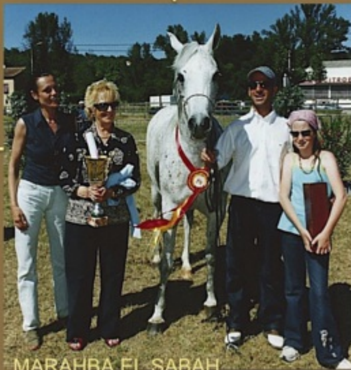
MARAHBA EL SABAH