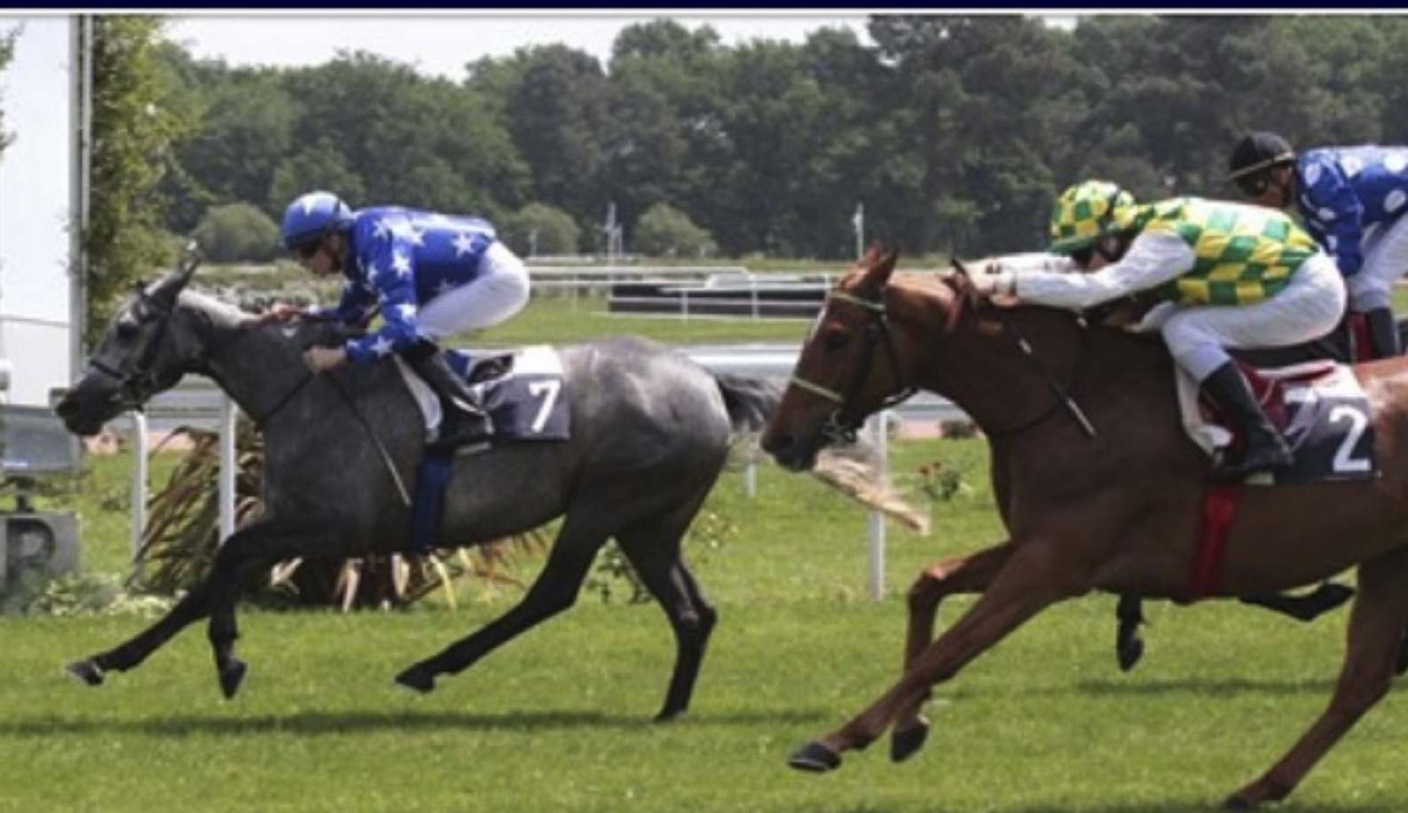
RAWAH GB 2015.05.11 BORDEAUX 1.900m