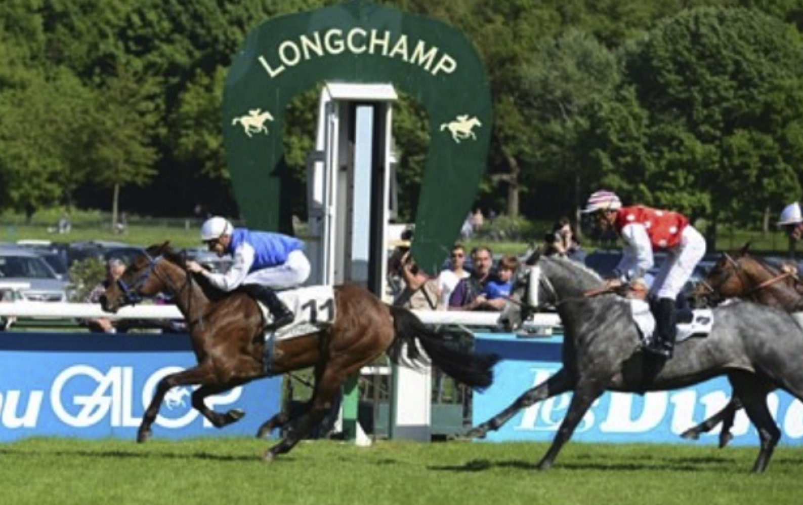
PRADA T HOL 2015.05.10 LONGCHAMP 2.000m