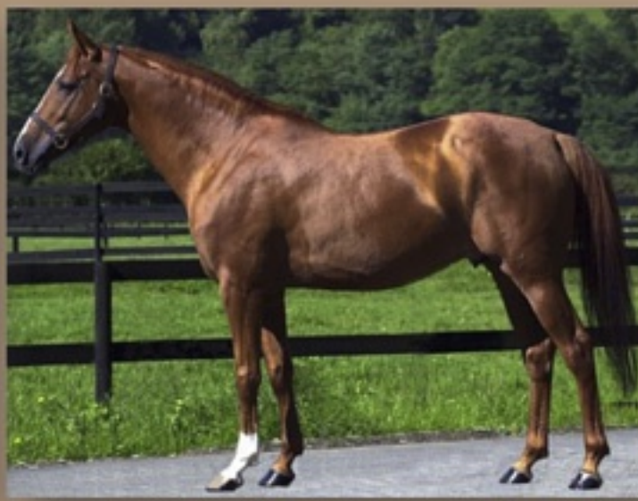
AL SAKBE 1995 -MORGANE DE PIBOUL-