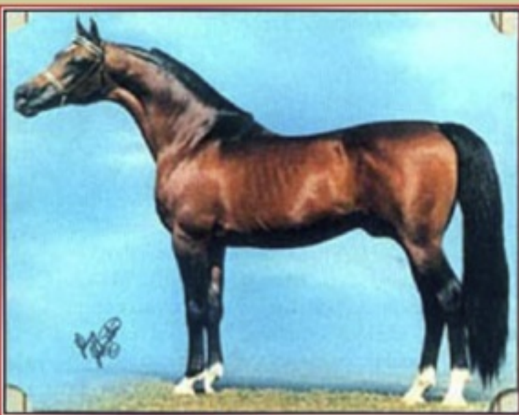
BASK POLISH LINES