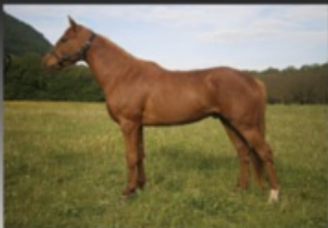
LE LOUP DE ROVON Ar