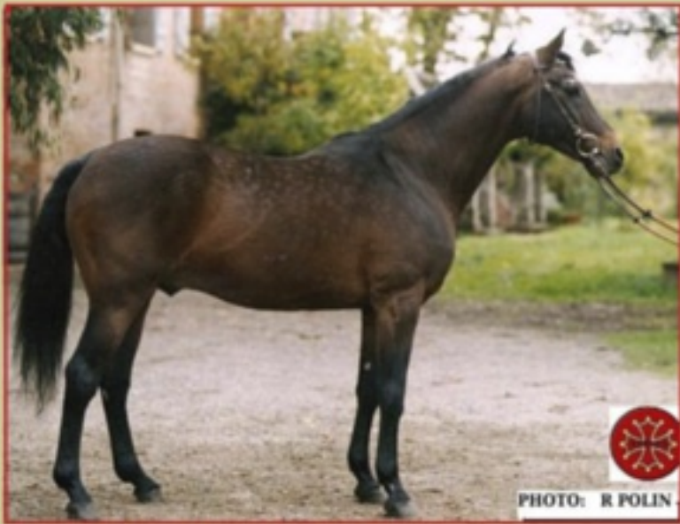
BAKARA FRENCH LINES