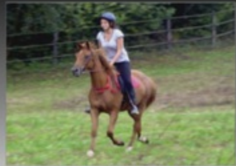
CARAMELLE DE ROVON Ar