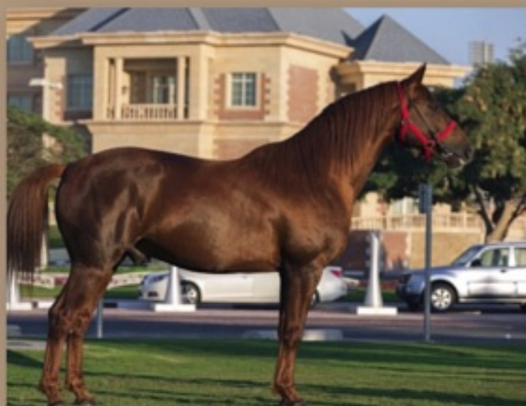
AL NOOR 2006 -NOISETTE AL MAURY-