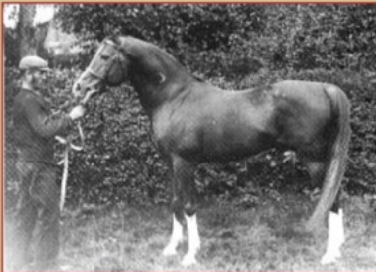
MESSAOUO CRABETT LINES

nose" has been bred in. In all my years as a breeder and seeing hundreds of foals born for many years I have never witnessed such a thing so I can only assume it is the headhunter's fever that has brought about such a bizarre defect. I was taught that the head was something to hang a bridle on and as long as the eye shone with intelligence and the nostrils could take in enough air to run it was just fine. Its the rest of the horse that matters and you start with the feet and work your way up, the head should be the last thing to be analyzed not the first.