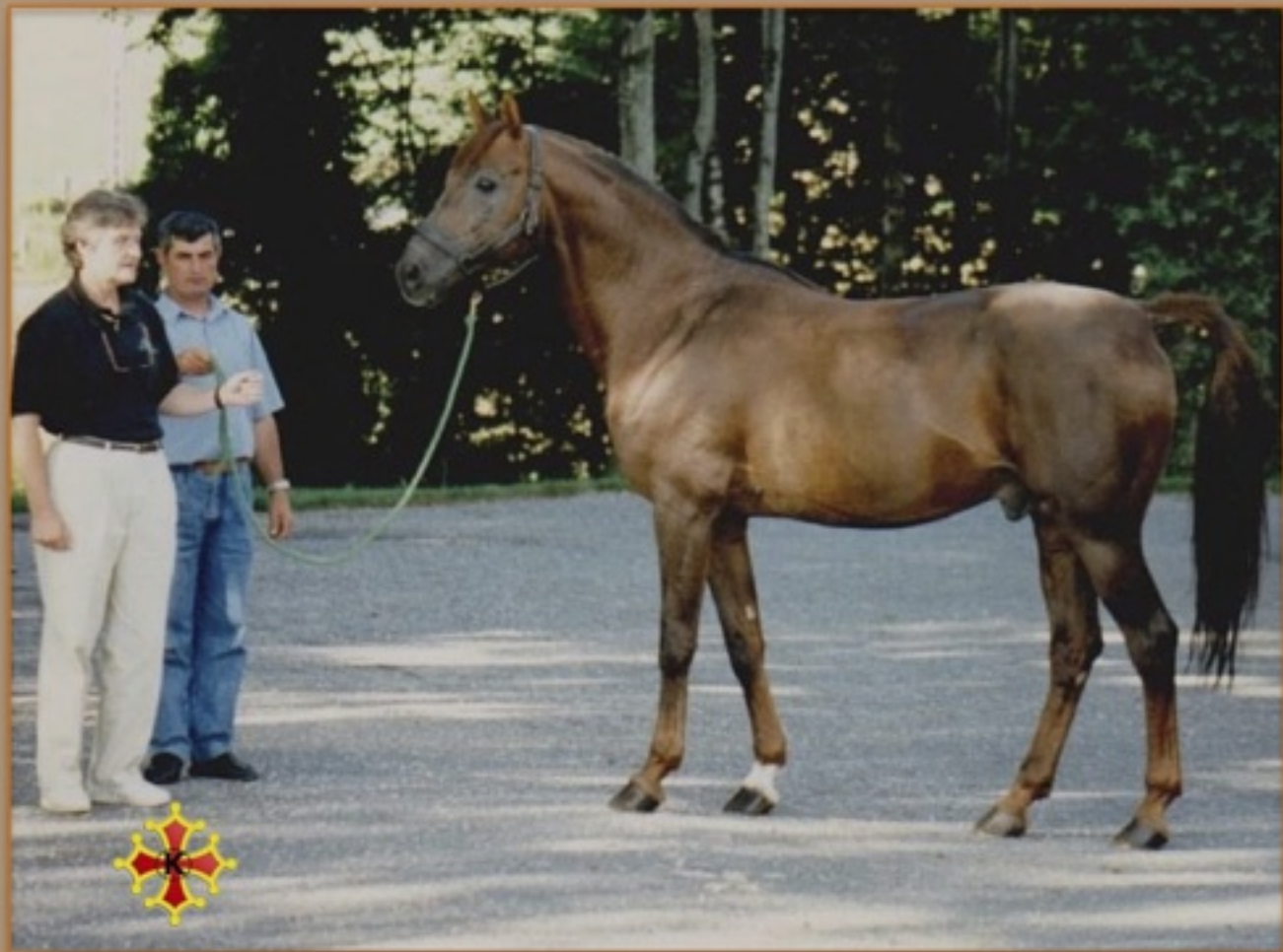
DJELFOR 1984 By MANGANATE & DJEBELLA