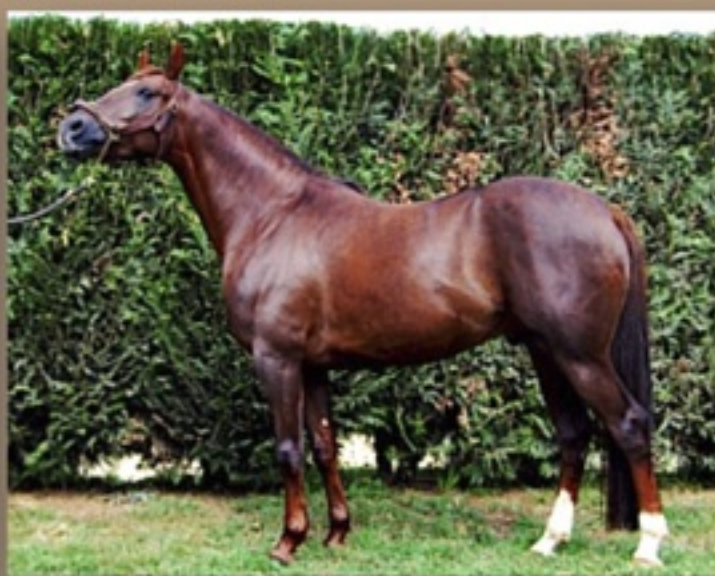
AKIM DE DUCOR 2005 -ISHIRA-