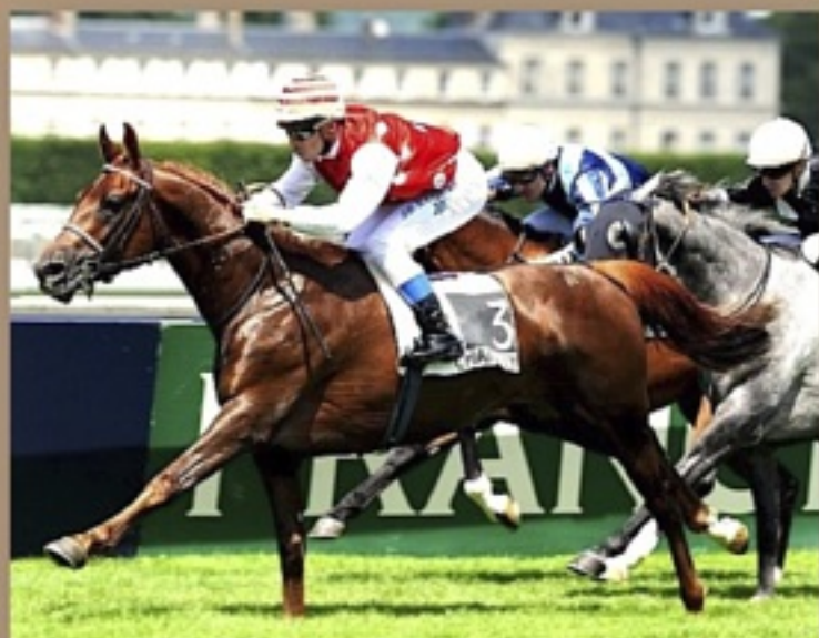
ABU ALABYAD 2010 -ORTIE-