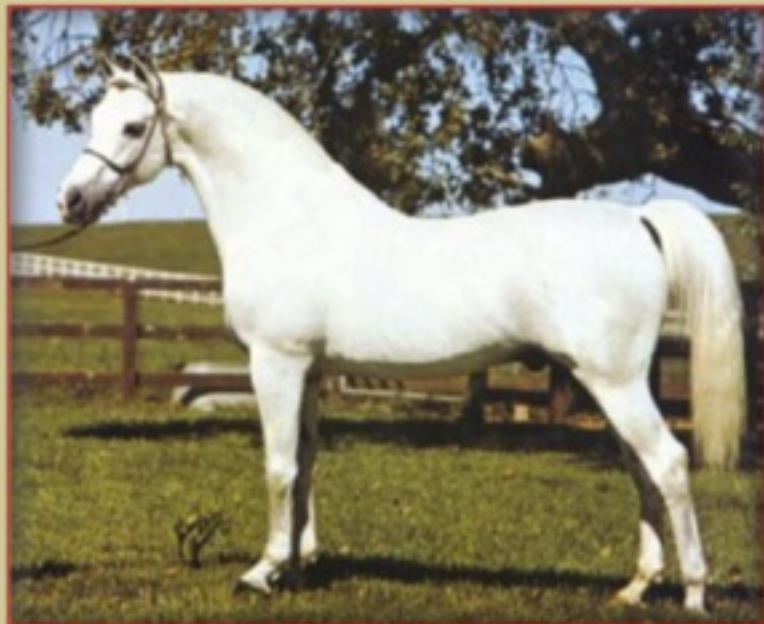
FIGUROSO SPANISH LINES

Arabian should not have any standard imposed upon it as it simply a horse with both parents being recognized in the stud book as Arabians. So much emphasis on the head has trained people to believe the complete falsehood that this is the key feature that must be on all Arabians. It is a puerile notion and must be discarded.