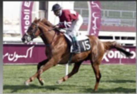
AL NOOR Ar