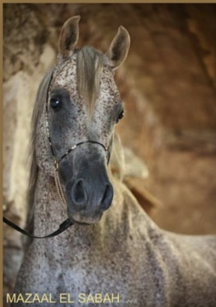
MAZAAL EL SABAH