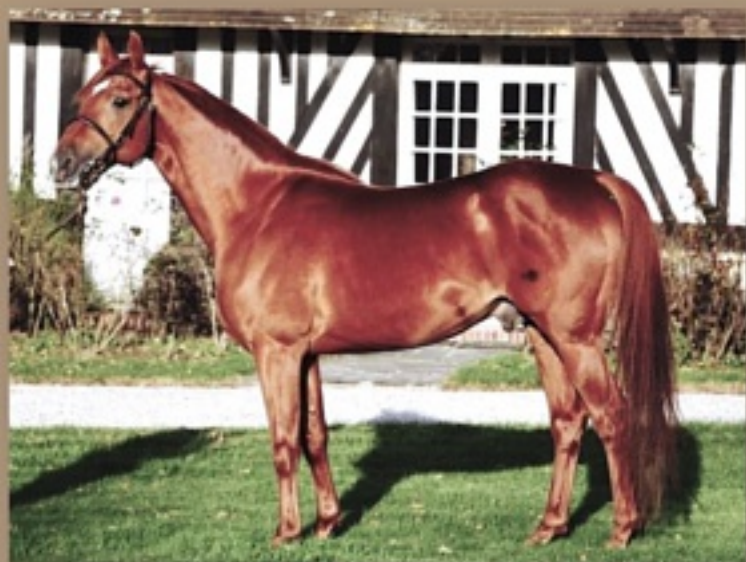
SERAPHIN DU PAON 2006 -BIN EL BEDIA-