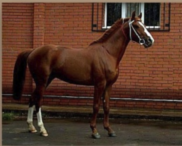
KARMEL DE FAUST 2004 -MARIFA-