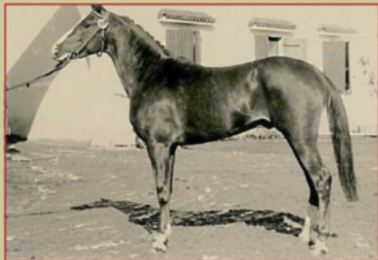
ESMETALI TUNISIAN LINES

Arabian should not have any standard imposed upon it as it simply a horse with both parents being recognized in the stud book as Arabians. So much emphasis on the head has trained people to believe the complete falsehood that this is the key feature that must be on all Arabians. It is a puerile notion and must be discarded.