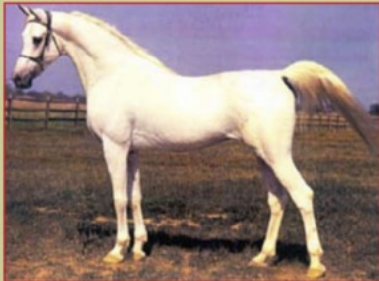
MORAFIC EGYPTIAN LINES