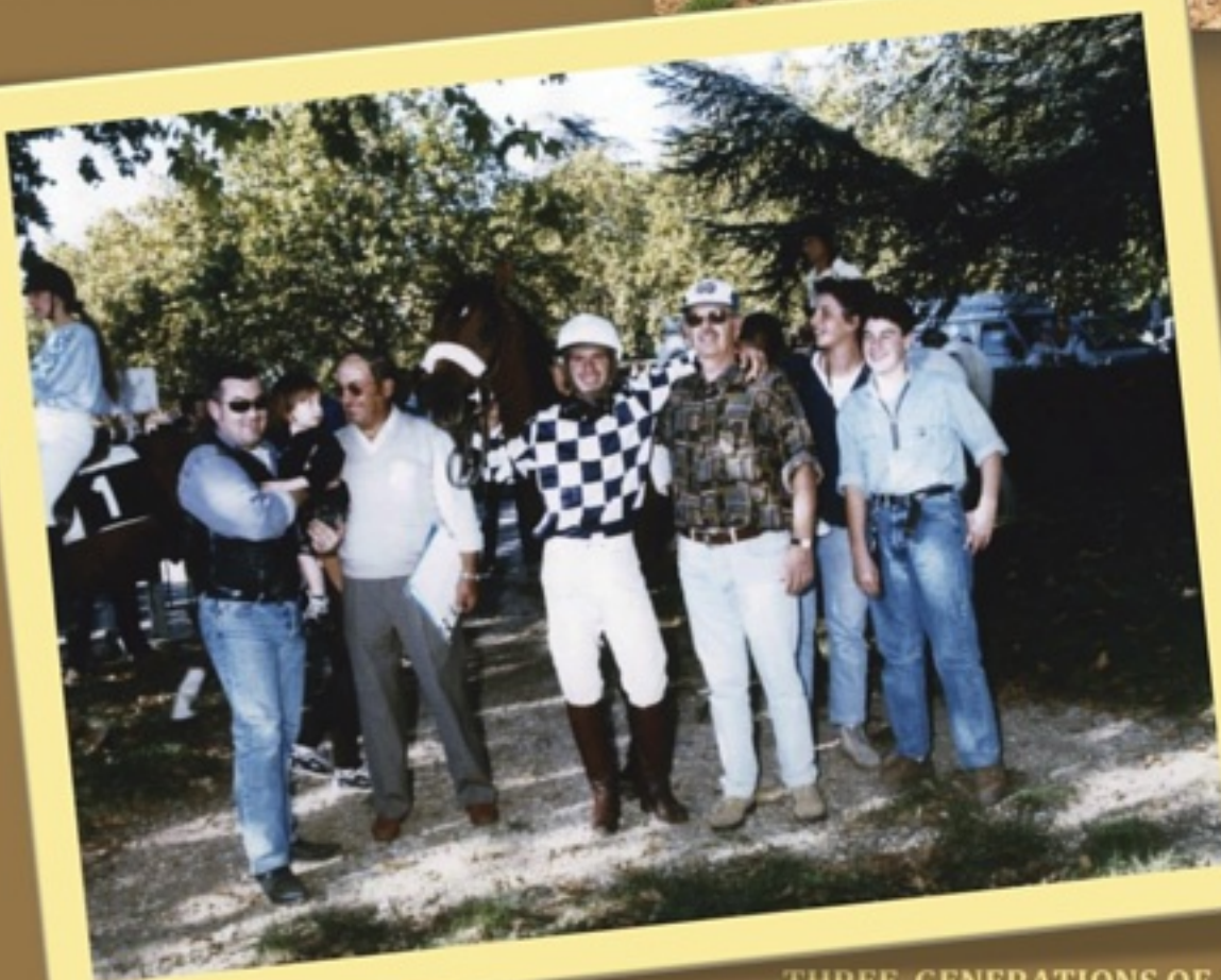
THREE GENERATIONS OF ABITA