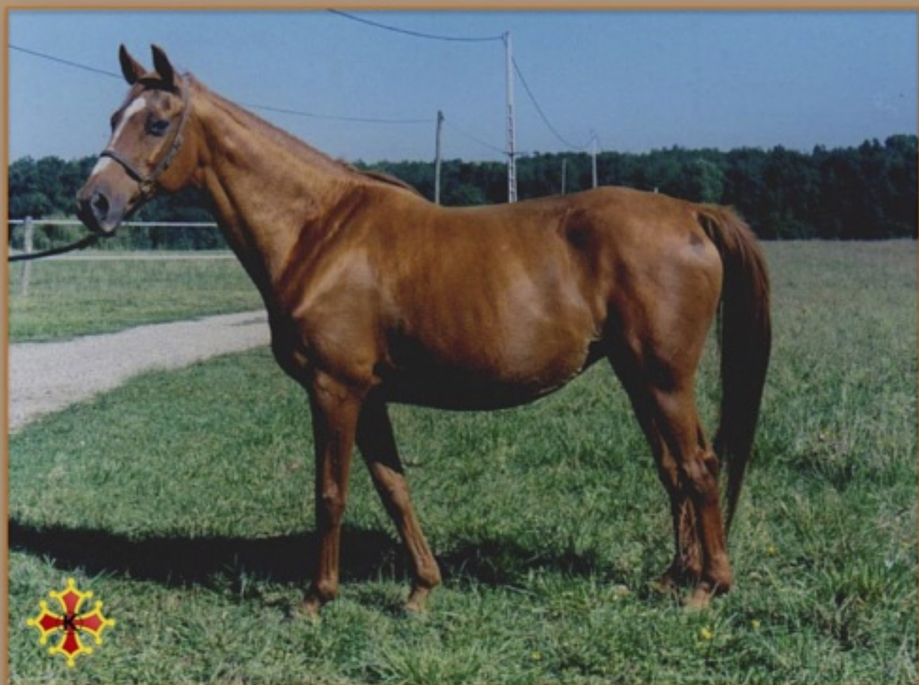
FANTASIA 1972 By GOSSE DU BEARN & FLEUR D'AVRIL