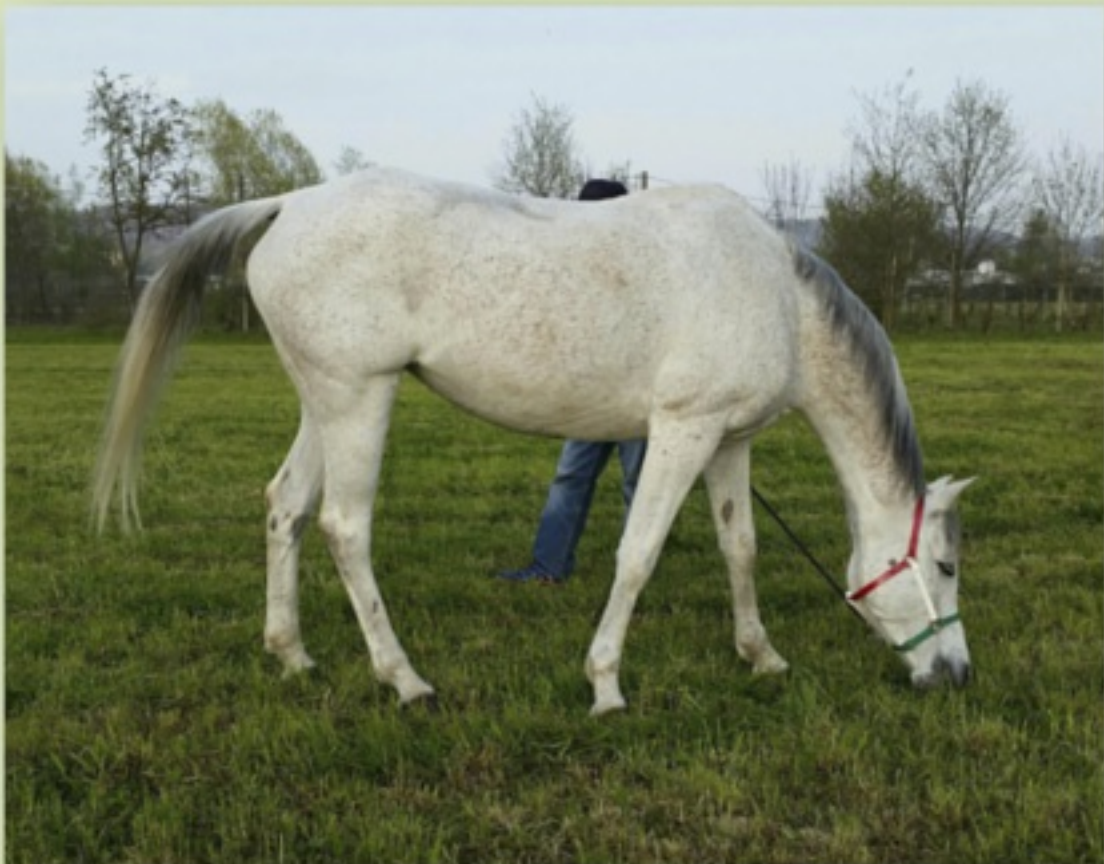
ALTA GRACIA By ISMAEL D'AUBANEL x PAEONIA by BAROUD III After endurance career, mare at GMC Stud – Italy

All these factors let us watch at the future with lot of optimism. We have strong new required of always more specific information from passionate and riders and we believe that this will be the engine to constantly improve all the sector. We still have expert riders and also very good young riders that have already well done in International competition. We will have a new emerging endurance horse generation and we are sure, that we will have all the possibility in the next year to participate at European compentition finally like protagonist!