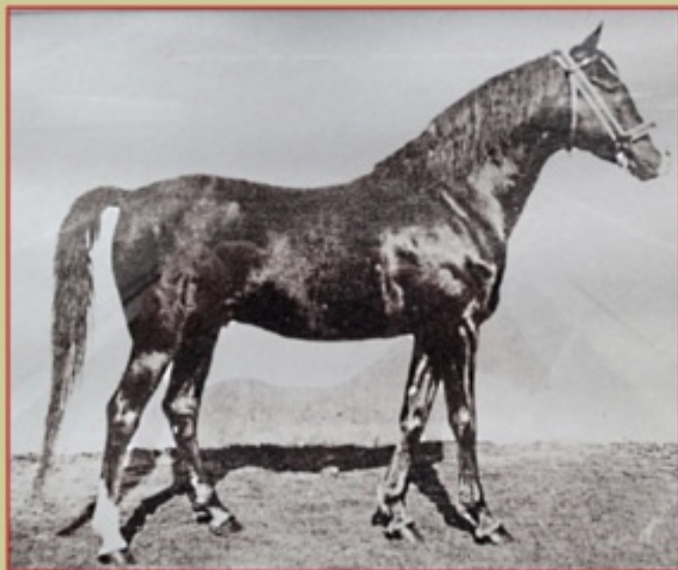
HAZIL ALGERIAN LINES