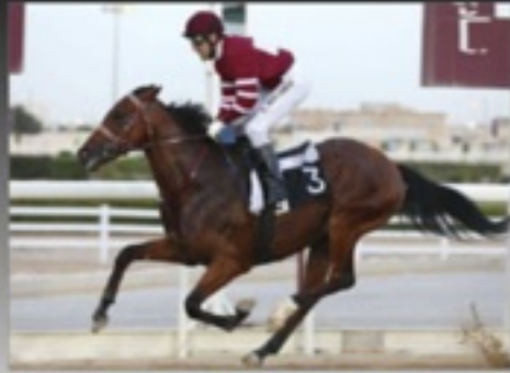
VERCORS DE ROVON Ar