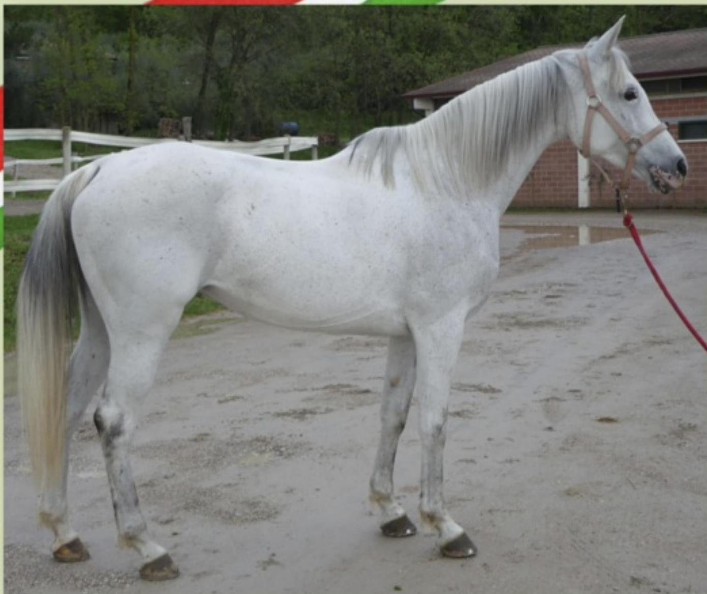
INCANDESCENCE By TIDJANI x TAJHIANE By NADEJNI After Endurance career, mare at GMC stud - Italy

At the beginning, endurance riders, in most cases, was passionate of country-riding, that started to try endurance competitions with their own country-horses, but in few time everybody understood the best abilities of Arabian horse in long distance races, so lot of riders opted for this breed, usually using horses retired from flat competitions (many times imported from east Europe especially Poland) or directly from arabian show events. This explain the high percentage of the upon table.