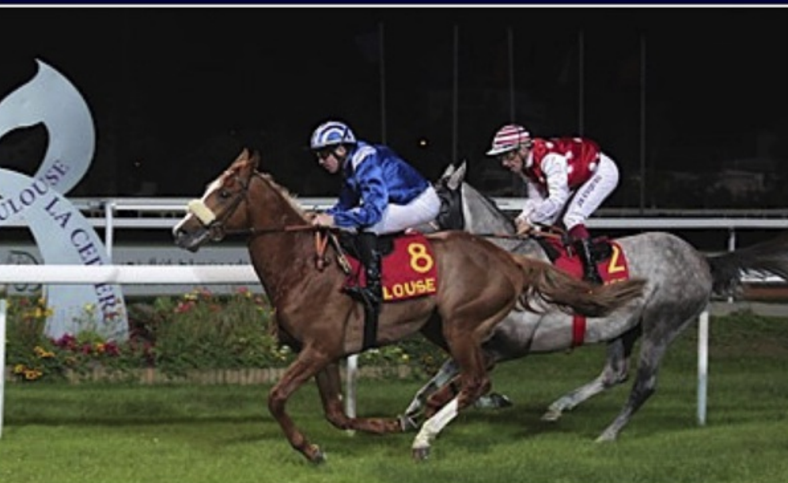
MURAAQIB 2015.05.25 TOULOUSE 1.600m