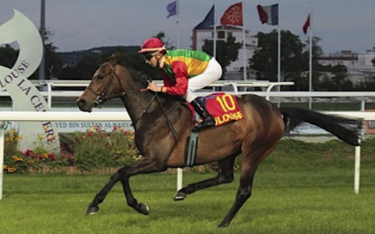
FAWARAH 2015.05.25 TOULOUSE 1.600m